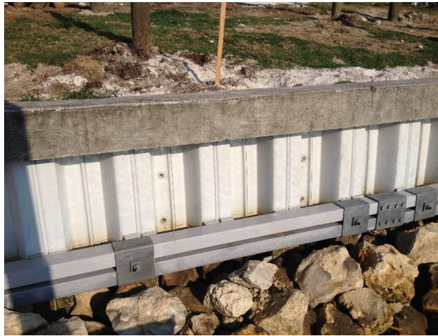
Double 4x6 w/ U-Bearing & Splice Plates (X-X Axis)